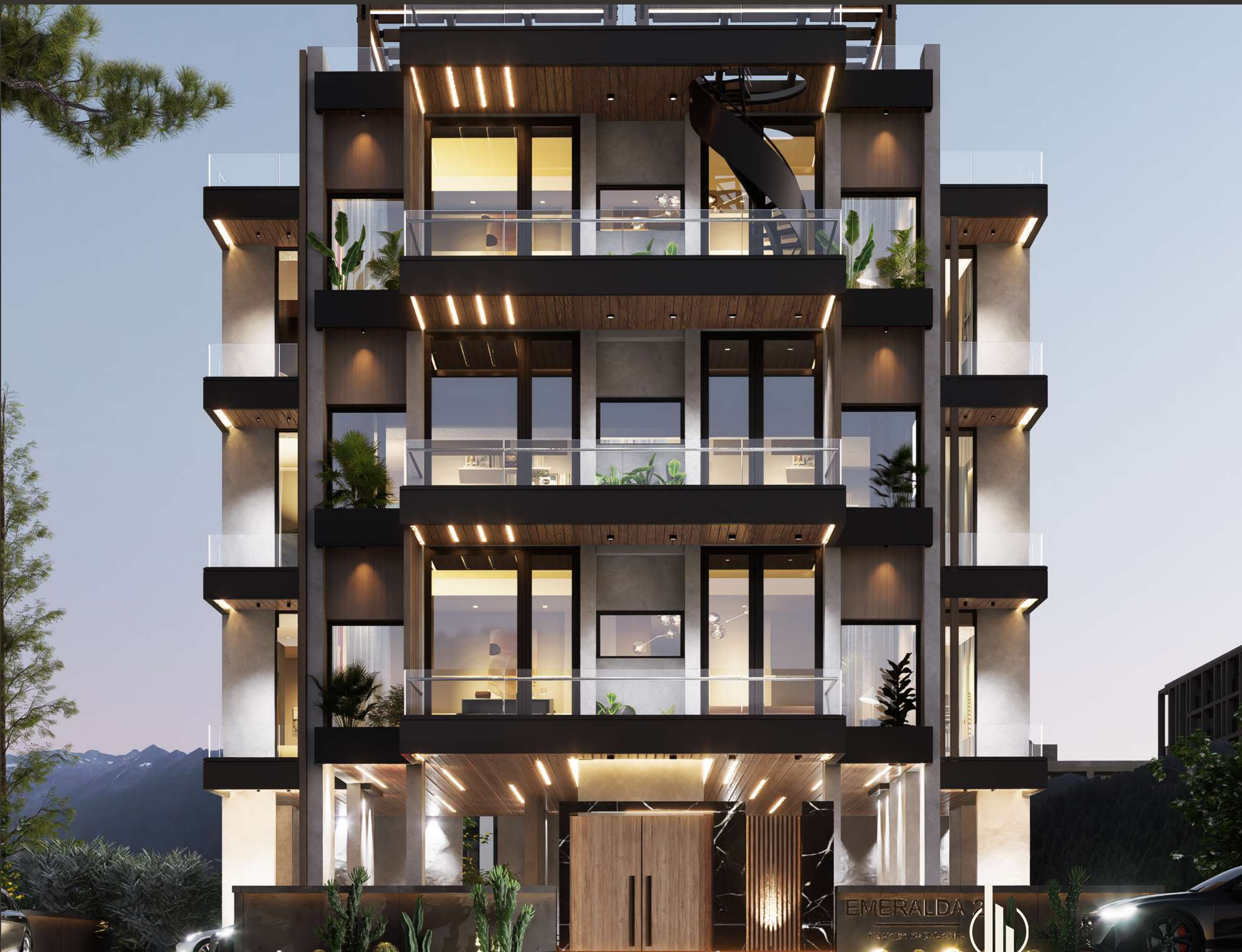
Facade Wide View