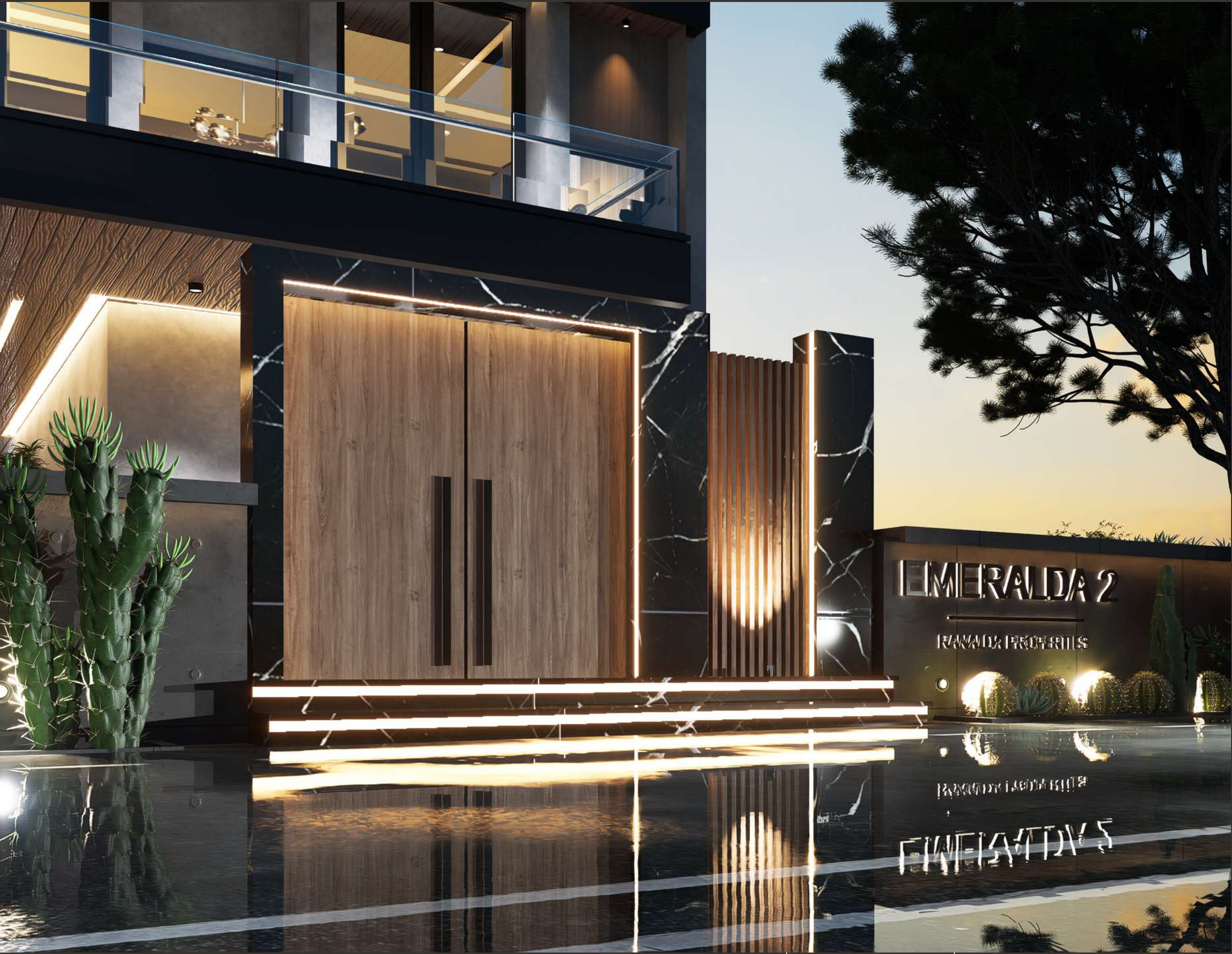
Main Entrance View