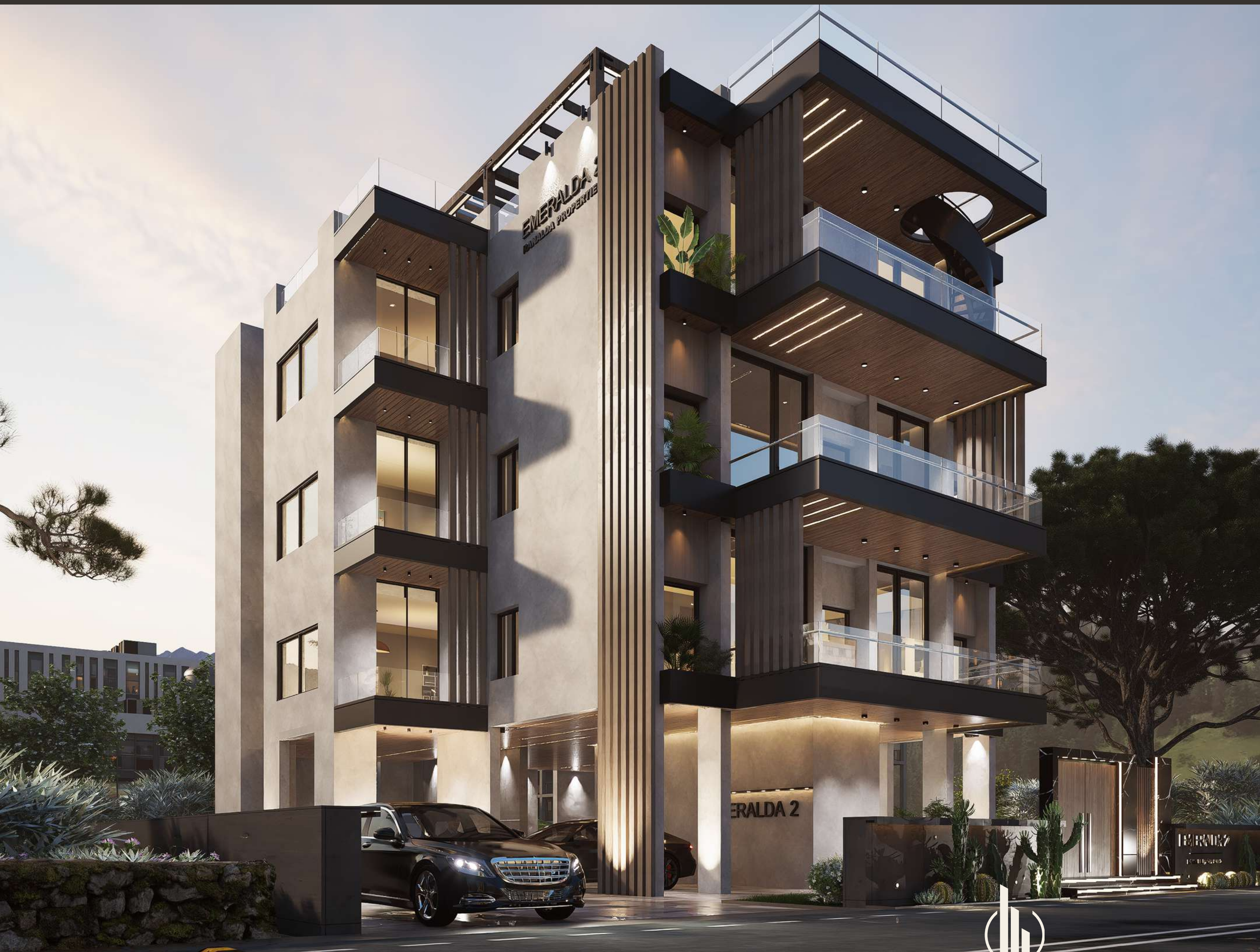
Facade / Side View