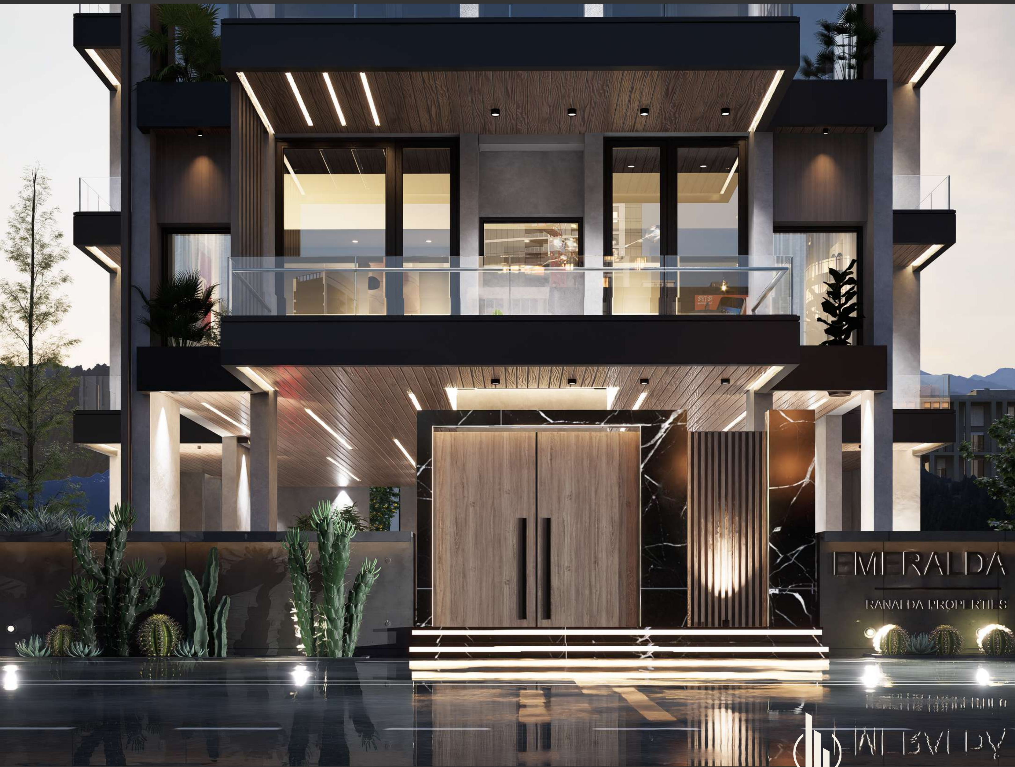
Main Facade Entrance