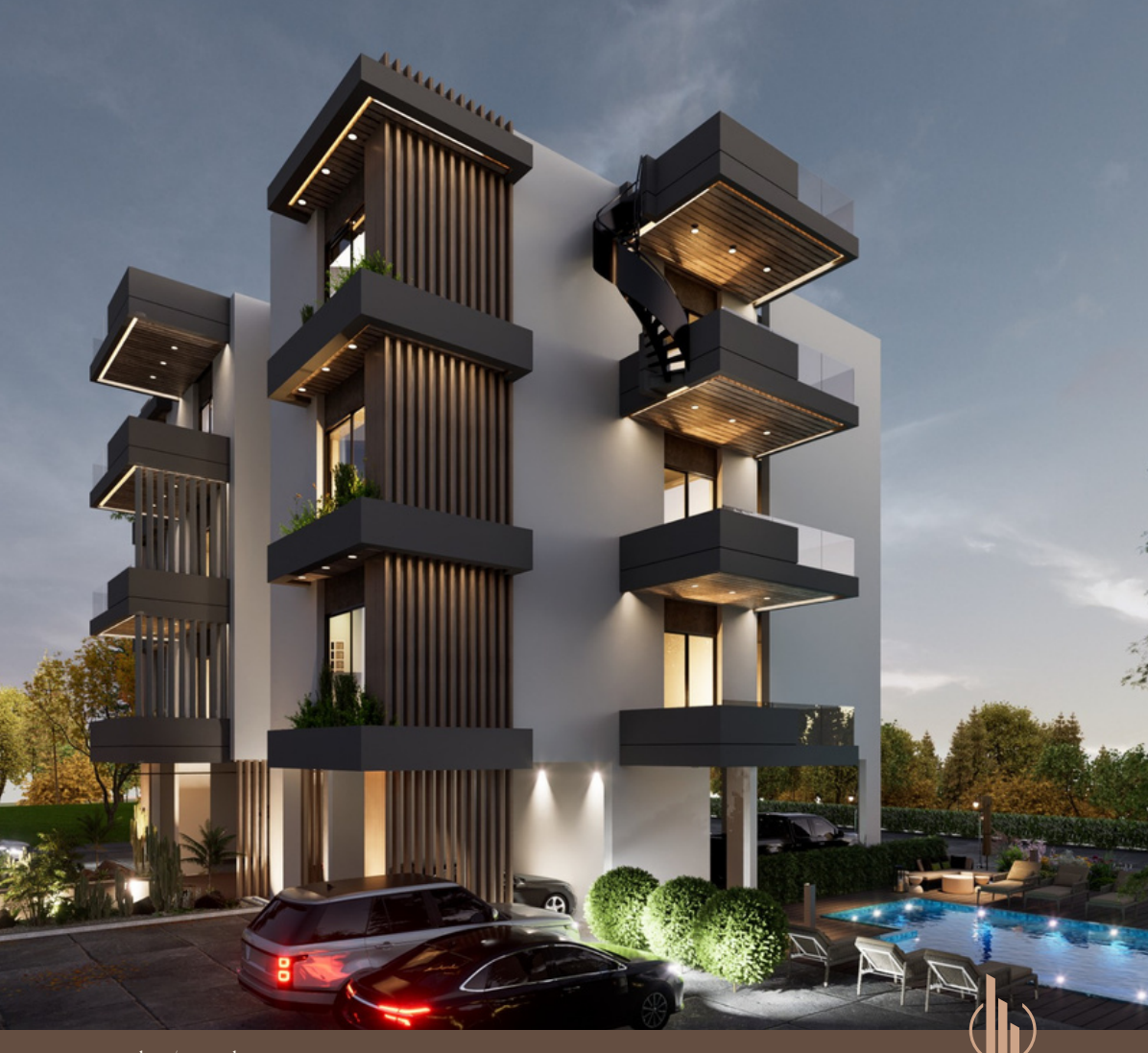
Facade / Pool View